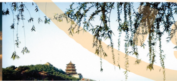
The Summer Palace