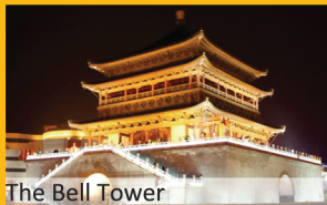
The Bell Tower