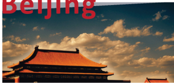
The Forbidden City