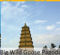
Big Wild Goose Pagoda