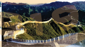
The Great Wall

Beijing is the capital of the People's Republic of China and one of the most populous cities in the world. The city is the country's political, cultural, and educational center, and home to the headquarters of many of China's largest state-owned companies.